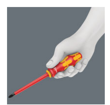
The outstanding design of the Kraftform handle that fits perfectly into the hand prevents hand injuries such as blisters and calluses.

Wera produces the Kraftform handle out of several materials with different properties. Α resistant plastic is used for the core which ensures that the blade is held securely even under high strain. A softer material is used for the coloured soft zones, which provides high frictional resistance and allows the transfer of high forces - resulting in less required screwdriving effort. The red sections with their hard surfaces prevent any "sticking" of the hand to the handle, making rapid repositioning of the hand possible.