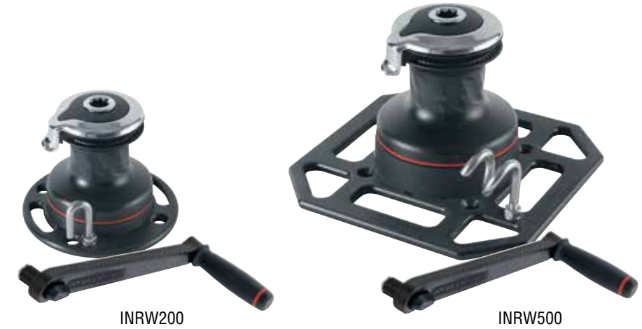
INRW200 Rigging Winch 200